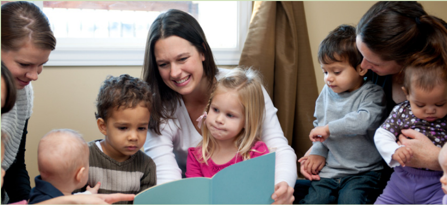
The librarian comes to you.

optimistically. Your efforts will better serve children and families and you will have a more active role in your community.