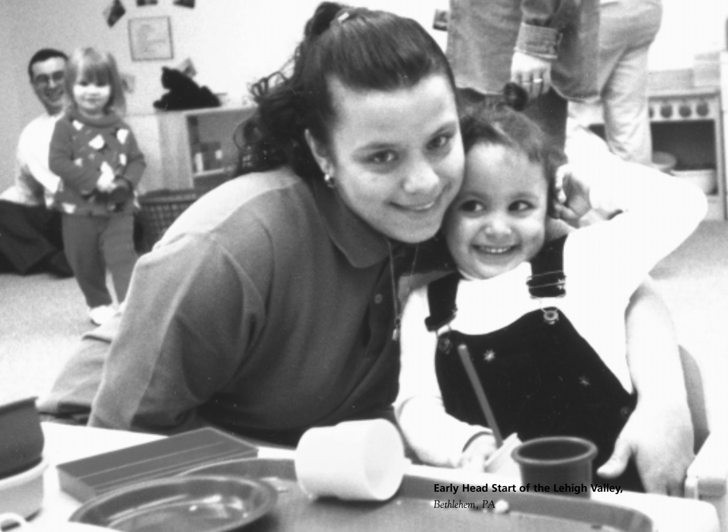
Early Head Start of the Lehigh Valley, Bethlehem, PA