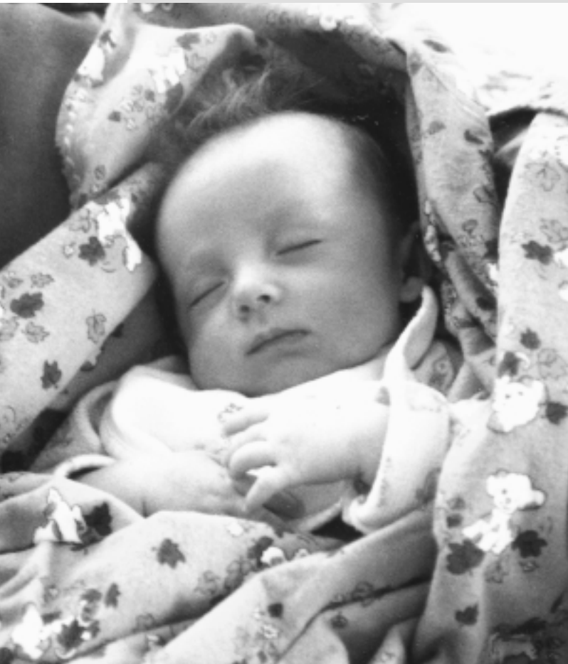
West Medford Early Head Start, Medford, OR