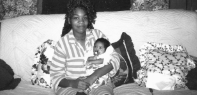
Murray Early Head Start, Murray, KY

In a comprehensive approach to curriculum, learning goals address all the developmental domains—motor, sensory, language, cognitive, and social and emotional skills. Furthermore, the concepts of learning and skill development are different for infants and toddlers than for older children. Rote teaching of discrete skills is developmentally inappropriate. Infants and toddlers learn through play, exploration, and interaction with objects and people in the context of meaningful relationships with trusted adults. See the box titled “Learning Through Play: for examples of the amazing amount of learning that happens through play.