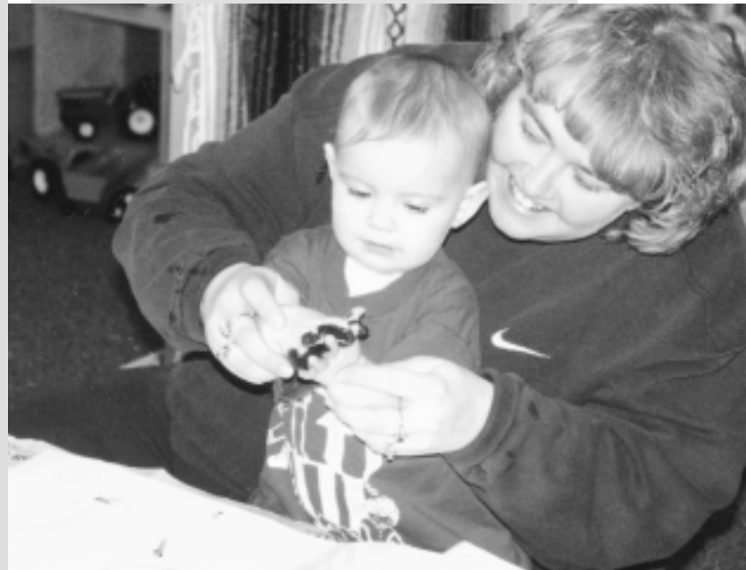
CESA #11 Early Head Start, Turtle Lake, WI

with young children and families is challenging, rewarding, and emotionally hard work. As a caregiver, it is vitally important that you pay attention to your stress level and how you take care of your own needs. Stress relief means different things to different people. Explore what helps you—exercise, time with friends, time alone, a good book, a hot bath, listening to music, going out dancing—and recognize when you need to nurture yourself so you have the emotional energy to nurture the families and children with whom you work.