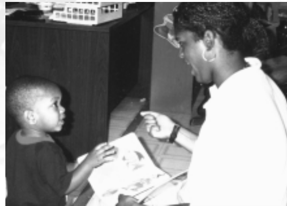
TN CAREs, Early Head Start, Weakley Co, TN

CESA #11 Early Head Start, Turtle Lake, WI