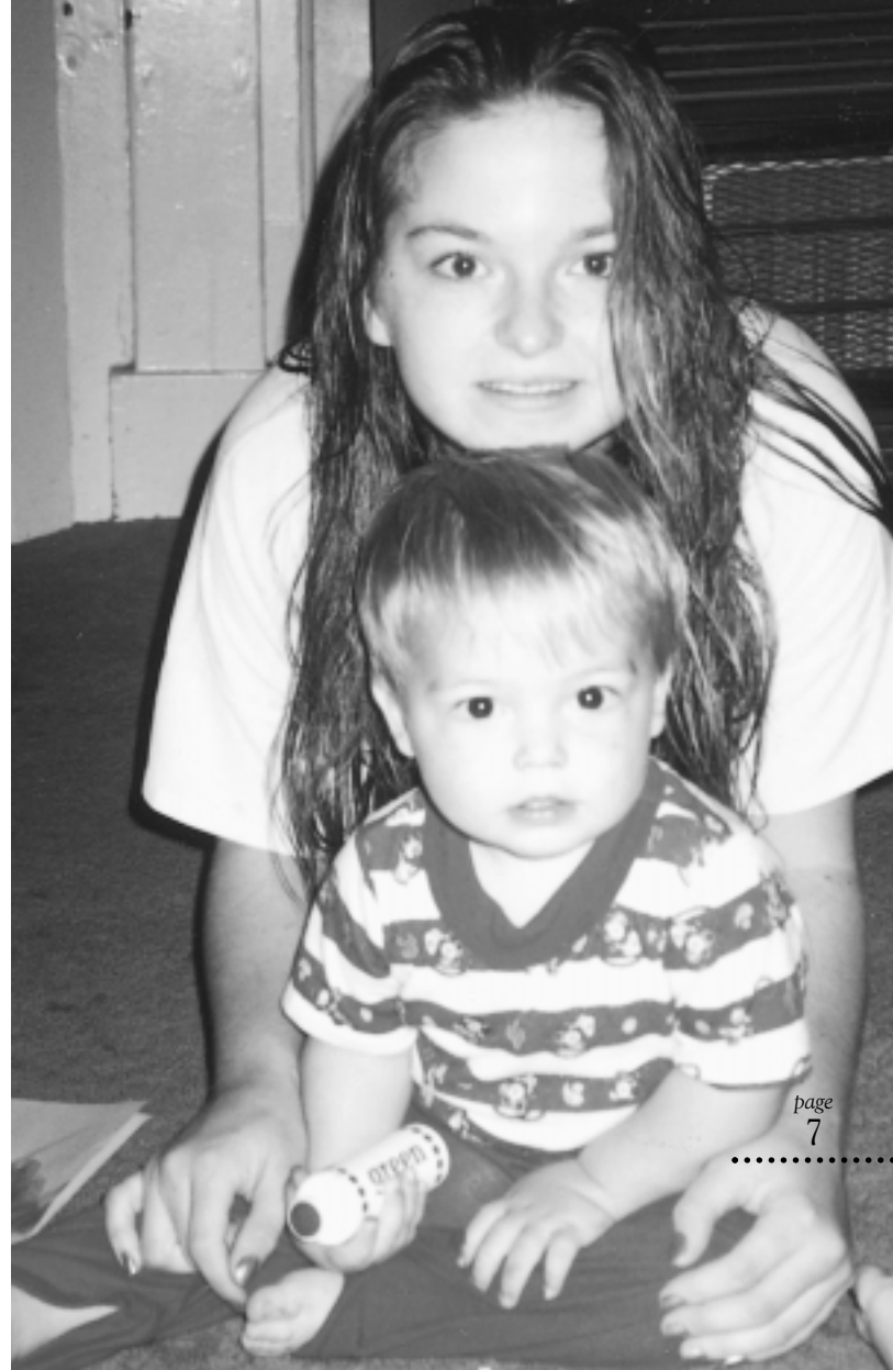
Murray Early Head Start, Murray, KY

Parents and other caretakers play an important role in helping infants regulate their states of arousal by tending to their needs: changing a wet diaper, feeding a hungry baby, rocking a tired baby to sleep, keeping sounds and visual stimulation at a comfortable level. Significant adults are the guides for learning who and what is “safe.” For example, a 9-month-old baby will look at a parent or a childcare teacher when a new person comes into the