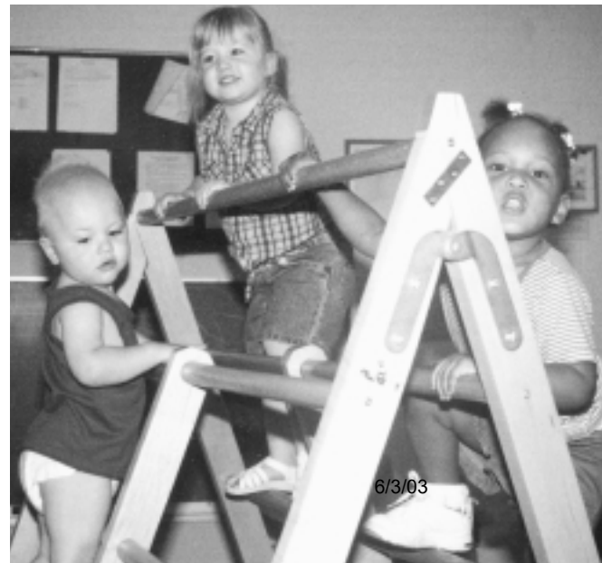
Murray Early Head Start, Murray, KY

loving, focused caregivers. The most recent research on early brain