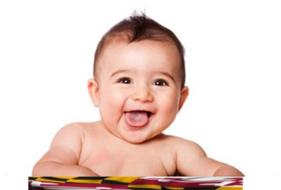
A Child's First Scholarship